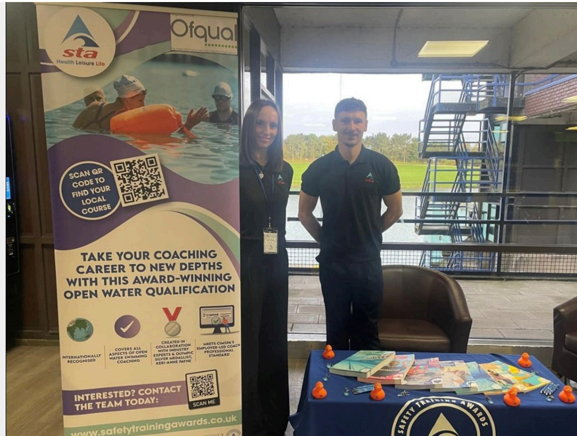
The team dived into all the networking opportunities at active-net's first open water swimming event.